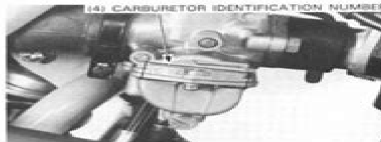
(4) CARBURETOR IDENTIFICATION NUMBER

The carburetor identification number is stamped on the right side of the carburetor.