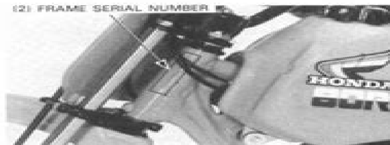
(2) FRAME SERIAL NUMBER

The frame serial number is stamped on the left side of the steering head.