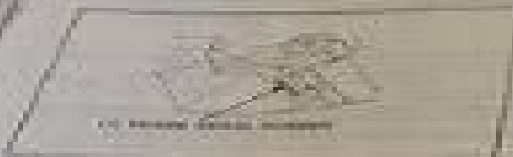
1-1 FRONT VIEW

The front view is shown in the right side of the drawing.