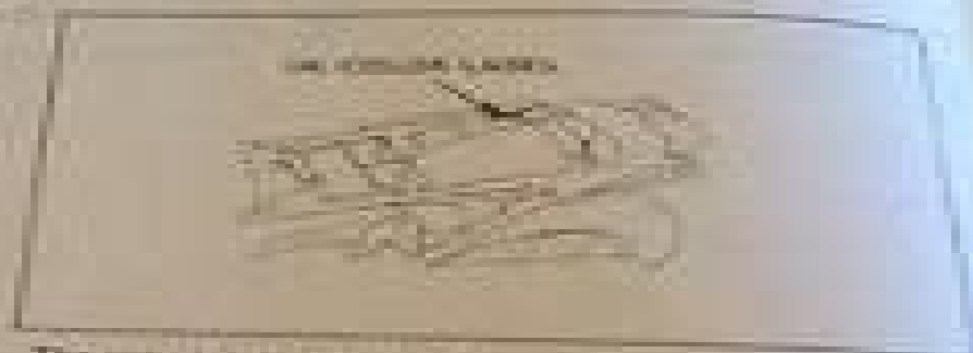
4-4 SIDE VIEW

The front view is shown in the right side of the drawing.