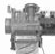
THROTTLE BODY IDENTIFICATION NUMBER

The throttle body identification number is stamped on the left side of the throttle body.