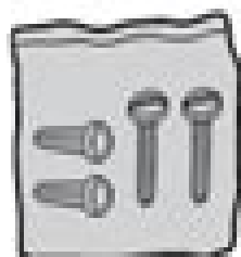
Wall anchors and mounting screws (2 each)