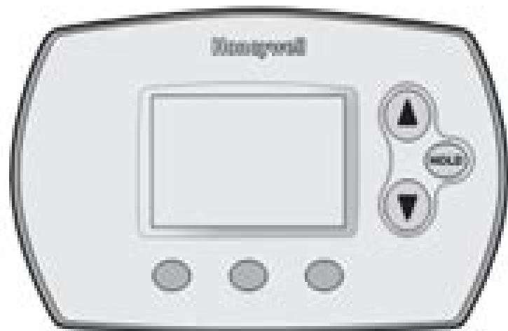
FocusPRO™ TH6110D programmable thermostat (wallplate attached to back)