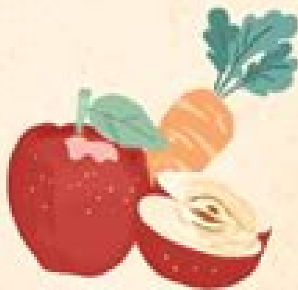
Fruit & Veggie Treats