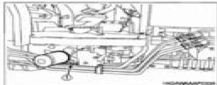
(4) Tractor serial number