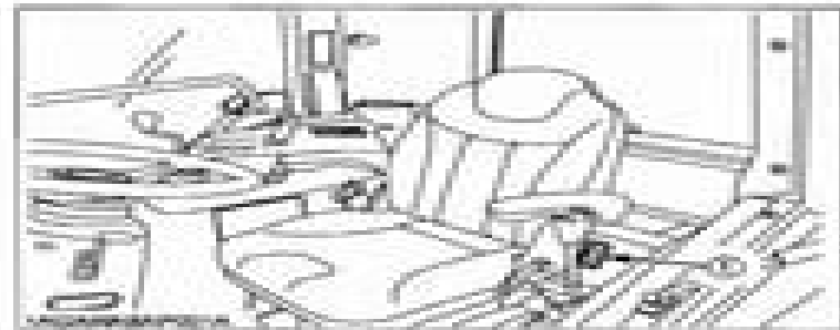
(3) CAB identification plate (CAB Serial No.)