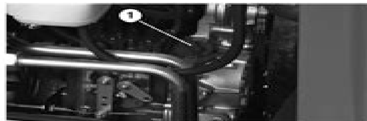
Figure 3 1. Filler Cap