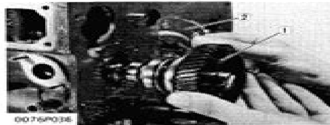
(1) Fuel Camshaft Assembly