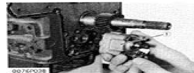
(1) Oil Pump Assembly