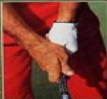
Grip turned too much clockwise