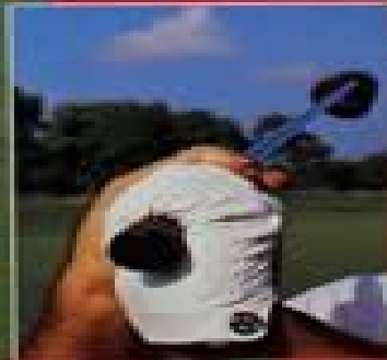
Club face open at the top of the swing