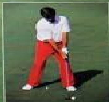
THE SLICE: Ball position too far forward