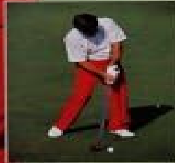
Impact with cupped left wrist and face open