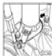
Diagram showing the removal of the fuse block cover. An arrow points to the cover being lifted away from the fuse block.