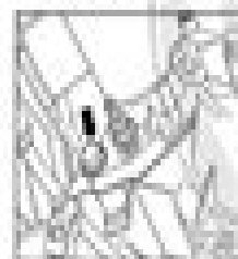
Diagram showing the removal of the fuse block cover. An arrow points to the cover being lifted away from the fuse block.