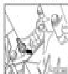
Diagram showing the removal of the fuse block cover. An arrow points to the cover being lifted away from the fuse block.