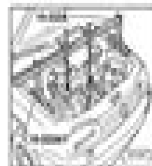
Diagram showing the removal of the fuse block cover.