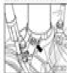
Diagram showing the removal of the fuse block cover. An arrow points to the cover being lifted away from the fuse block.