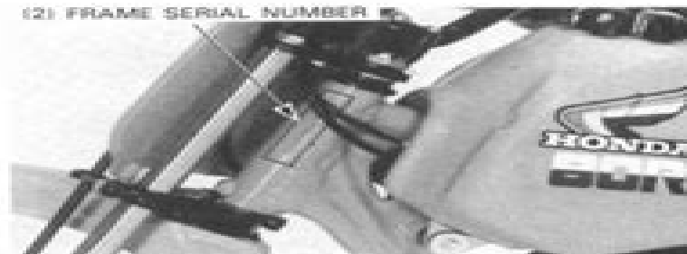
(2) FRAME SERIAL NUMBER

The frame serial number is stamped on the left side of the steering head.