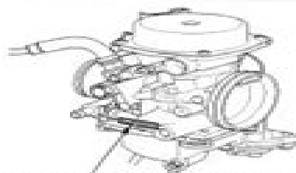
CARBURETOR IDENTIFICATION NUMBER