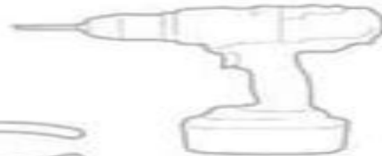
Drill and drill bit (7/32 in)