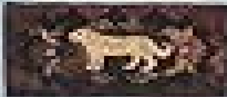
Figure 2. A rectangular object, possibly a fossil or a piece of wood, mounted on a light blue background.