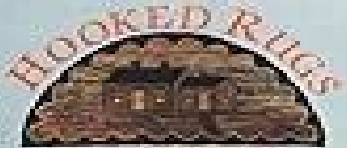
Figure 1. A large, dark, semi-circular object, possibly a fossil or a piece of wood, mounted on a light blue background.