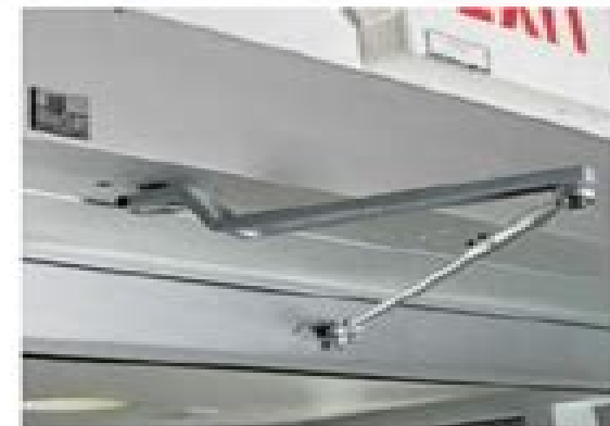
Surface Applied Operator