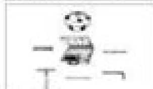
Fig. 3 Valve Seat Cutter Set