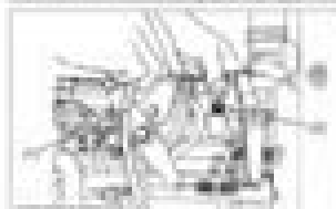
Fig. 4 Vacuum Leak Tester