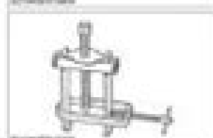
Fig. 2 Specializer Puller Set