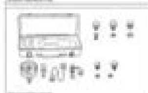
Fig. 5 Oil Pressure Tester