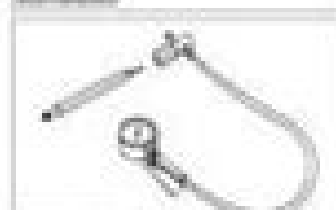
Fig. 4 Compression Tester