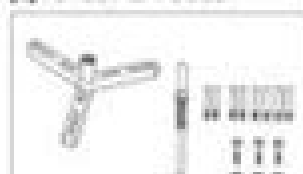
Fig. 1 Flywheel Puller