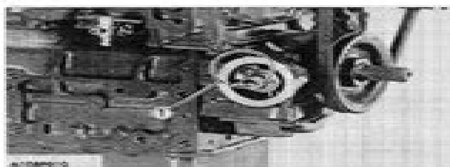
(1) Relief Valve