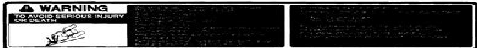
(2) Part No. K3211-6582-2