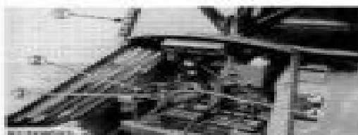
11460 (1) Grip (2) PTO Clutch Lever (3) ATA PTO Cable (4) PTO Clutch Wire