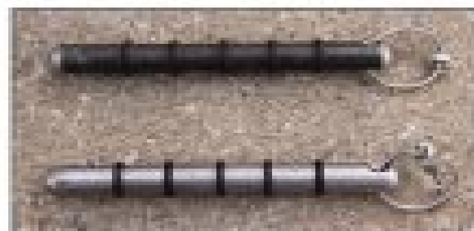
Personal Item - avoid these look like Kubotan.