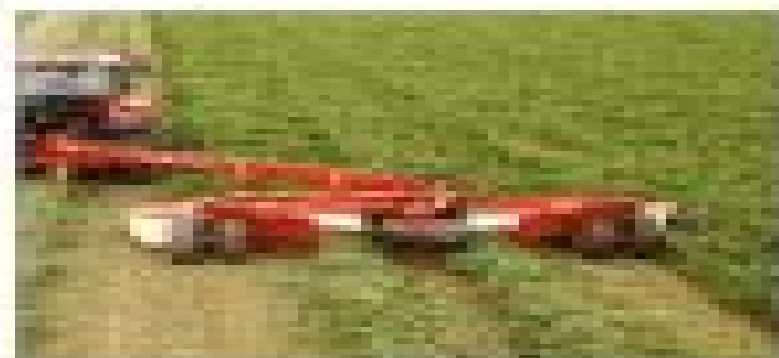
Working at the edge