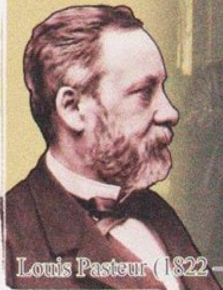
Louis Pasteur (1822 – 1895)