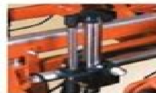
Hydraulic Log Clamp