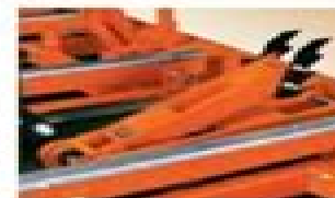
Hydraulic Log Turner