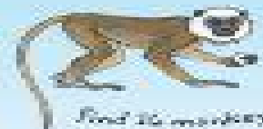
Find 16 monkeys.