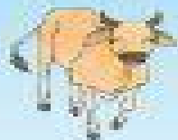
Find seven cows.