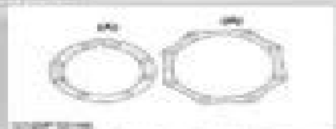
Figure 1.2: Bearing Case Cover Gasket