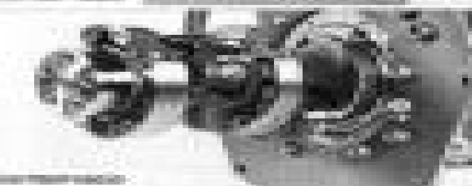
Figure 1.5: Bearing Case Cover Assembly