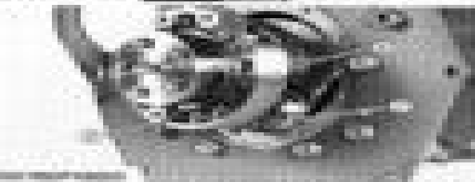
Figure 1.4: Bearing Case Cover Assembly