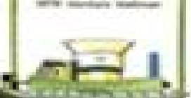
1908 Ford Model T