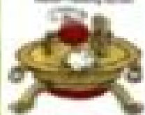
1783 Joseph-Montgolfier's hot air balloon