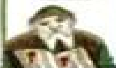
1859 Thomas Edison's light bulb