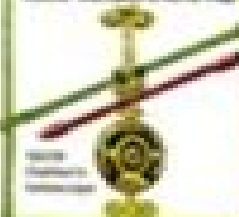
1712 Thomas Newcomen's steam engine