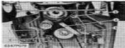
63477002 (1) Spring (4) Tension Pulley (2) Speed Change Rod (5) Clutch Rod (3) Tension Spring