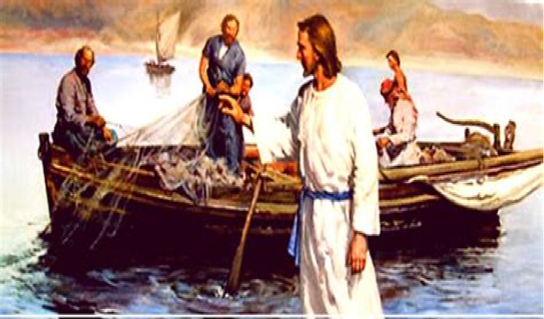
JESUS CALLS FOUR FISHERMEN