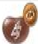
A&W® Root Beer