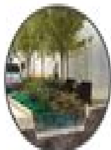
Low Impact Development