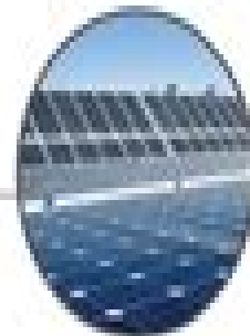
Solar PV Panels