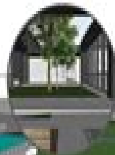
Adaptive Comfort & Natural Ventilation