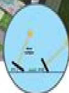
Best Energy-saving Angle