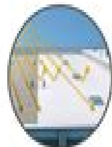
White Cool Roof