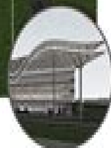
Double Roof Canopy