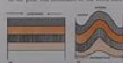
Fig. 18 (a) The horizontal strata of the earth's crust before folding. (b) Compression shortens the crust forming fold mountains.

In the great fold mountains of the world such as