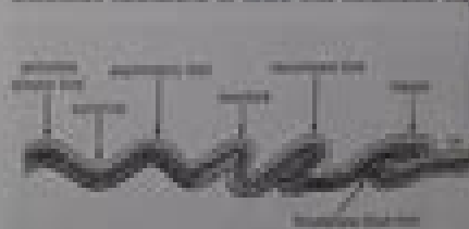
Fig. 19 Types of folding.

is formed (Fig. 19). If it is pushed still further, it becomes a recumbent fold (Fig. 19). In extreme cases, fractures may occur in the crust, so that the upper part of the recumbent fold slides forward over the lower part along a thrust plane , forming an overthrust fold . The over-riding portion of the thrust fold is termed a nappe (Fig. 19). Since the rock strata have been elevated to great heights, sometimes measurable in miles, fold mountains may