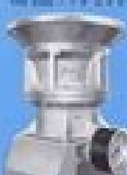
Fine Reduction—Excellent Product High Speed—Large Capacity Low Overall Operating Costs