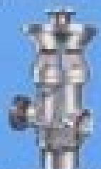
Light Weight but Sturdy High Efficiency Low Feed Rates