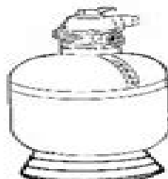
Laser L160, L190