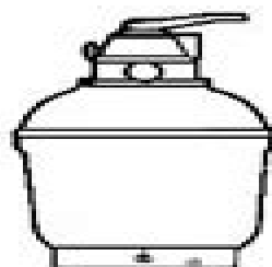
MFM L225, L250 MFM15, MFM17

This step-by-step installation and maintenance guide will provide the necessary information for you to easily maintain the equipment.