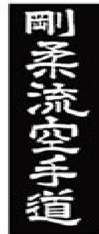
Goju Ryu Karatedo