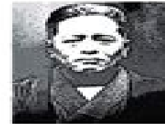
Chojun Miyagi Sensei Founder of Goju Ryu