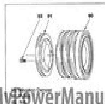
Figure 75: Crankshaft Damper and Pulley