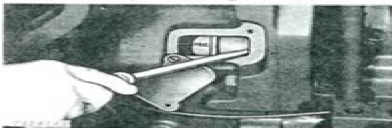
Fig. 5-Setting Engine to TDC