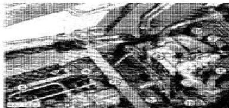
Fig. 2-Removing Engine Components