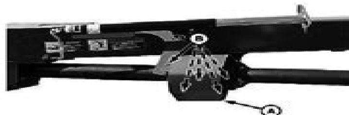
9. ES4127-LR2 Shield