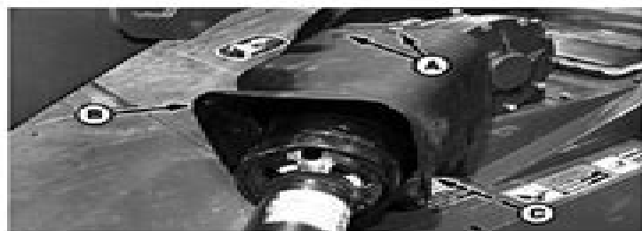
1. ES4105-LR2 Shield