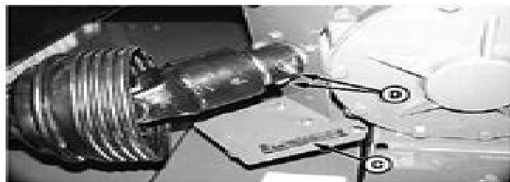
ES4124-LR2 1500 Rpm Shield