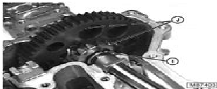
Long Axle Side