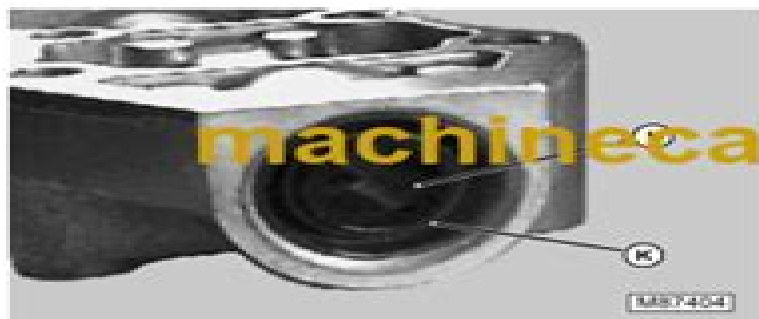
Long Axle Side