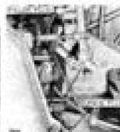
Cranking Engine Transmission Oil Plug