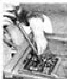
Figure 10-4-6—Checking Battery Specific Gravity

If liquid level is too low to check, add distilled water. It will take 10 to 15 minutes for the water and electrolyte to mix.