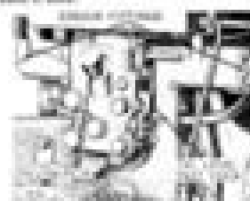
Figure 10-4-7—Fuel Tank Plug and Oil Level Vent

If the tractor is equipped with Power Shift, open the oil level vent (Figure 10-4-7) and see if it leaks out. If it does not, add good clean SAE 10 or 10-W oil until it does.