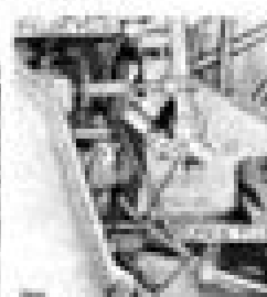
Charging Engine Transmission Oil Plug