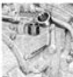
Figure 10-4-3—Adjusting the Filter Opening