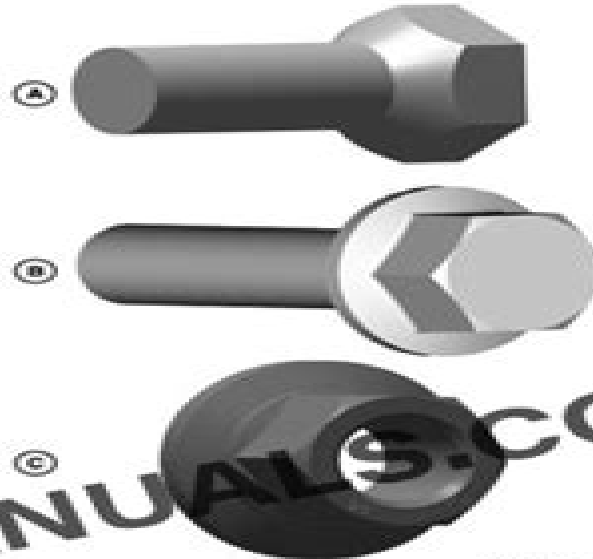
Wheel Hardware Types