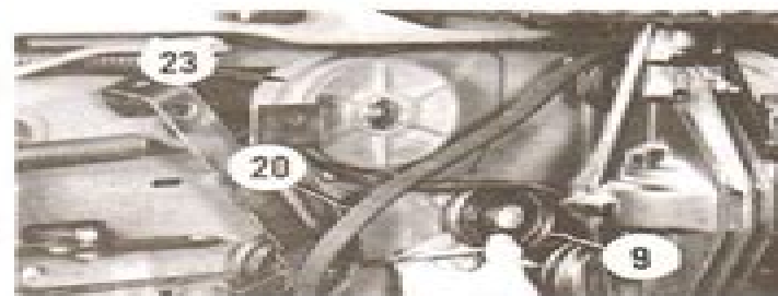
Fig. JD34—To remove variator (23), remove primary (lower) belt from variator, then force secondary (upper) belt idler (9) against spring tension and remove the secondary belt from variator (23).