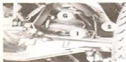
Fig. JD32—Belt guides (G and I) must be moved to remove belts from engine pulley. Refer to text for belt removal procedure.

Install secondary belt by reversing removal procedure. Adjust belt guides as previously outlined.