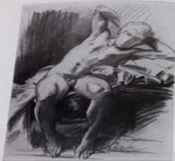
Adonis by Sir David Wilkie, about 1800, 1800-1801 A classical and other study, 1800-1801, 1800-1801 1800-1801, 1800-1801