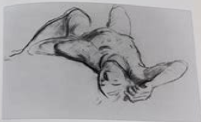
Adonis by Sir David Wilkie, about 1800, 1800-1801 A classical and other study, 1800-1801, 1800-1801 1800-1801, 1800-1801