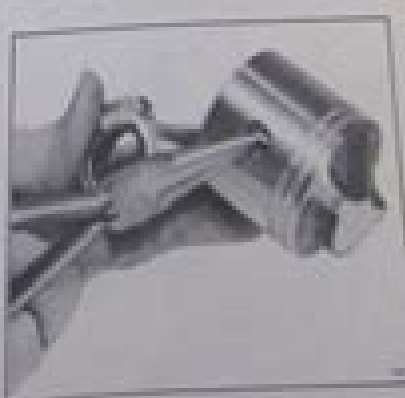
Figure 1.11. Borrowing Costs for Retaining Rights

2. Remove the rings from the postures by jerking the ends down enough to grip them with gloves and then breaking them loose from the postures. DO NOT try to move the rings over when they are not stuck. Instead