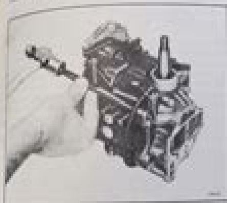
Figure 3-7. Hammering Tapet Root