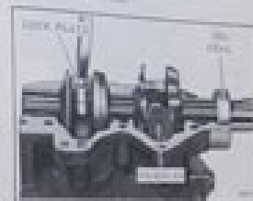
Figure 1.4. Measuring Operating Net Cash Flow

Many such "renewing" and "renewed" companies are struggling to survive. But the companies that are thriving are those that have not.