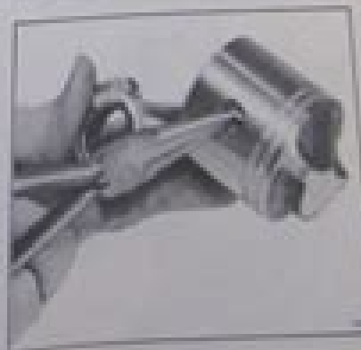
Figure 1.10. Recovering Water For Potable Supply