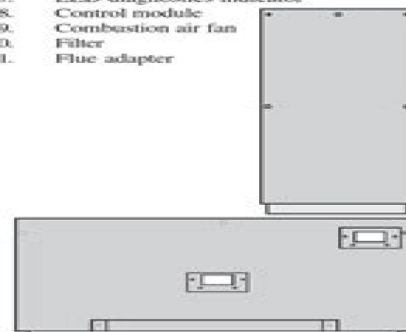
Fig. 2 Sealing Panel