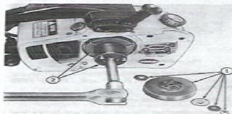
Fig. 3-Removing Clutch

NOTE: Sprocket nut and clutch have left-hand threads. Hold flywheel with TY7249 Filter Wrench or use JDM-102 Flywheel Holding Tool.