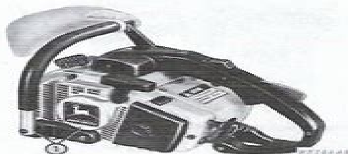
Fig. 2-Removing Fan Cover and Front Handle