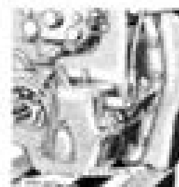
Figure 10-4-9—Open Shaft Clutch Housing Filler Plug

If the tractor is equipped with an engine drive "box" power shaft, check the oil level in the shaft by inserting the filler plug (Figure 10-4-9). Oil level should be up to level of bottom thread in filler opening. If it is not, add good clean SAE 10-W oil until its level is correct.