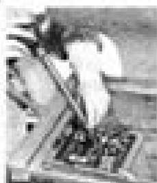
Figure 10-4-6—Checking Battery Specific Gravity

If liquid level is too low to check, add distilled water. It will take 10 to 15 minutes for the water and electrolyte to mix.