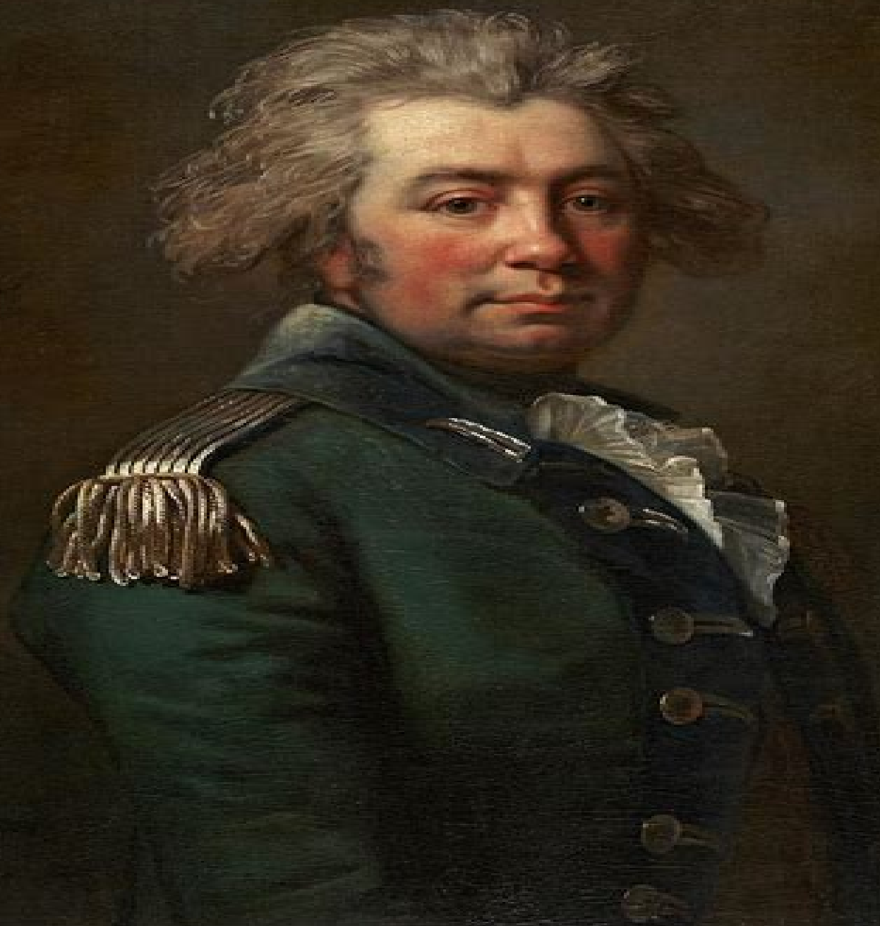
LE GENERAL SIMCOE.